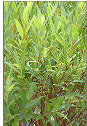
Flame Willow foliage