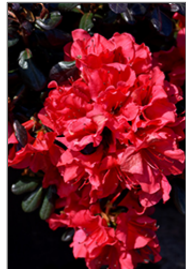
Johanna Azalea flowers