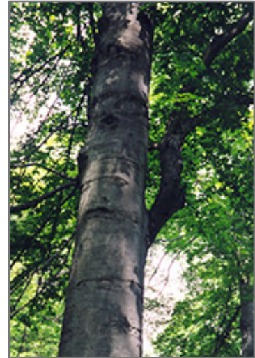
American Beech bark

This tree should only be grown in full sunlight. It requires an evenly moist well-drained soil for optimal growth, but will die in standing water. It is not particular as to soil pH, but grows best in rich soils. It is quite intolerant of urban pollution, therefore inner city or urban streetside plantings are best avoided, and will benefit from being planted in a relatively sheltered location. This species is native to parts of North America.