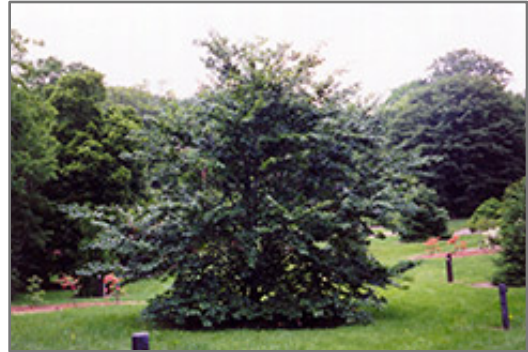
American Beech