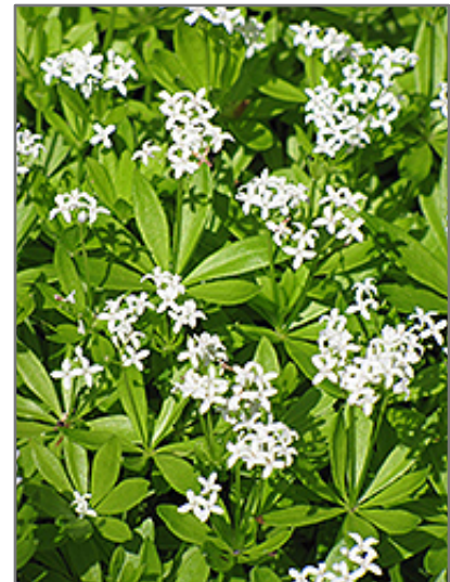
Sweet Woodruff flowers