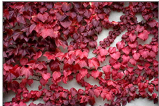
Veitch Boston Ivy in fall