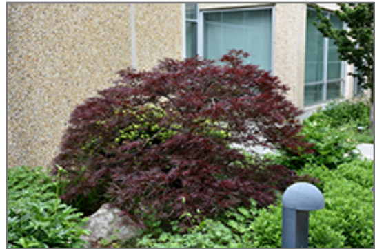
Red Dragon Japanese Maple

This is a relatively low maintenance tree, and should only be pruned in summer after the leaves have fully developed, as it may 'bleed' sap if pruned in late winter or early spring. It has no significant negative characteristics.