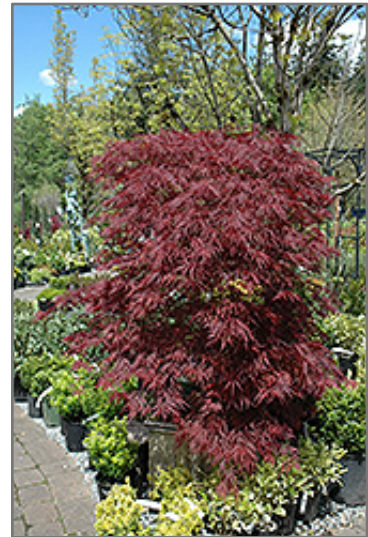
Red Dragon Japanese Maple

Red Dragon Japanese Maple is a fine choice for the yard, but it is also a good selection for planting in outdoor pots and containers. Because of its height, it is often used as a 'thriller' in the 'spiller-thriller-filler' container combination; plant it near the center of the pot, surrounded by smaller plants and those that spill over the edges. It is even sizeable enough that it can be grown alone in a suitable container. Note that when grown in a container, it may not perform exactly as indicated on the tag - this is to be expected. Also note that when growing plants in outdoor containers and baskets, they may require more frequent waterings than they would in the yard or garden.