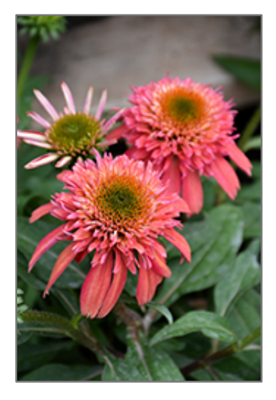
Double Scoop Cranberry Coneflower flowers

93 East Main Street Hopkinton MA 02148 - (508) 435-3414 160 Pine Hill Road Chelmsford MA 01824 - (978) 349-0055 COMMERCIAL: commsales@westonnurseries.com - (508) 293-8028