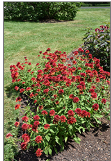
Double Scoop Orangeberry Coneflower in bloom