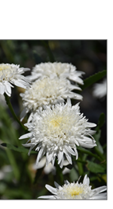
Ice Star Shasta Daisy flowers