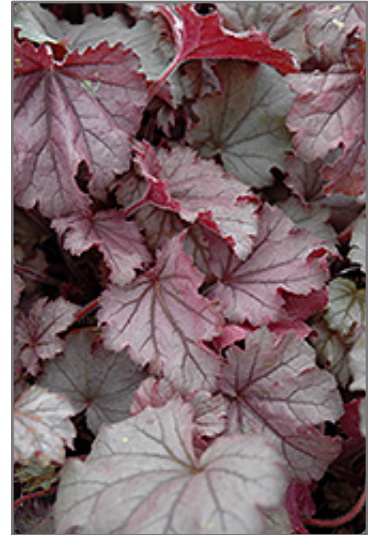
Little Cuties Sugar Berry Coral Bells foliage

Little Cuties Sugar Berry Coral Bells is recommended for the following landscape applications;