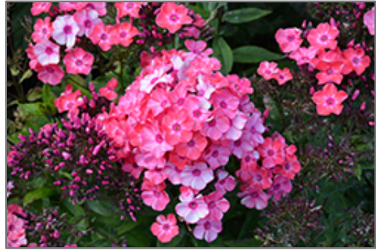
Garden Girls Glamour Girl Garden Phlox flowers

Garden Girls Glamour Girl Garden Phlox is recommended for the following landscape applications;