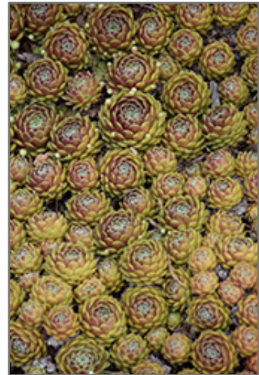
Piloseum Hens And Chicks

Piloseum Hens And Chicks is recommended for the following landscape applications;