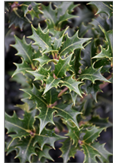
Gulftide False Holly foliage

Gulftide False Holly is recommended for the following landscape applications;