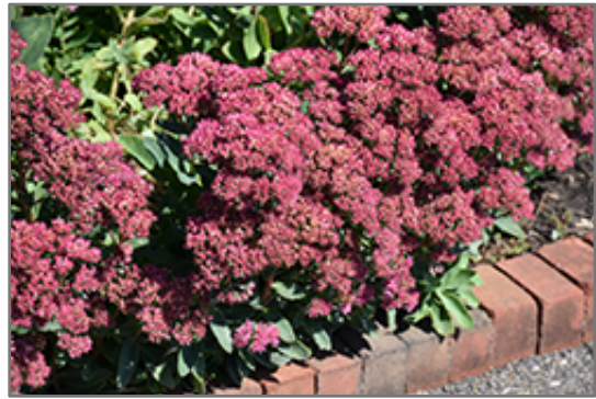
Carl Stonecrop in bloom

This is a relatively low maintenance plant, and is best cleaned up in early spring before it resumes active growth for the season. It is a good choice for attracting bees and butterflies to your yard, but is not particularly attractive to deer who tend to leave it alone in favor of tastier treats. It has no significant negative characteristics.