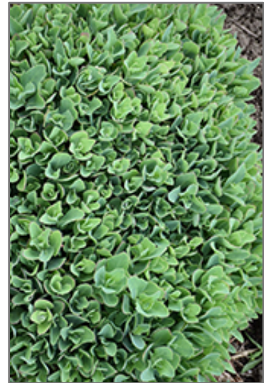
Carl Stonecrop foliage

Carl Stonecrop is a fine choice for the garden, but it is also a good selection for planting in outdoor pots and containers. It is often used as a 'filler' in the 'spiller-thriller-filler' container combination, providing a mass of flowers and foliage against which the larger thriller plants stand out. Note that when growing plants in outdoor containers and baskets, they may require more frequent waterings than they would in the yard or garden.