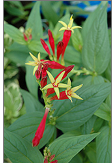
Indian Pink flowers

Indian Pink is recommended for the following landscape applications;