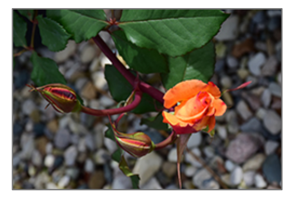
Chris Evert Rose flower buds