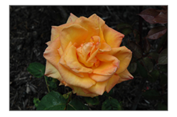
Chris Evert Rose flowers

CustomerCare@WestonNurseries.com 93 East Main Street Hopkinton MA 02148 - (508) 435-3414 160 Pine Hill Road Chelmsford MA 01824 - (978) 349-0055 COMMERCIAL: commsales@westonnurseries.com - (508) 293-8028