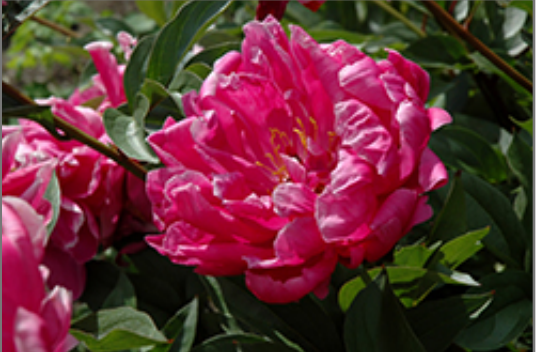
Double Red Peony flowers