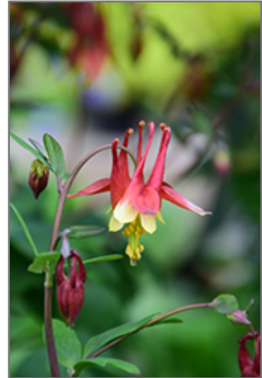
Wild Red Columbine flowers

Wild Red Columbine is recommended for the following landscape applications;