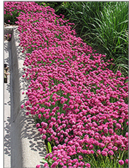
Dusseldorf Pride Sea Thrift in bloom

Dusseldorf Pride Sea Thrift is recommended for the following landscape applications;