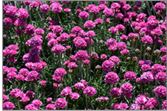
Dusseldorf Pride Sea Thrift flowers

Dusseldorf Pride Sea Thrift will grow to be only 6 inches tall at maturity extending to 8 inches tall with the flowers, with a spread of 8 inches. Its foliage tends to remain low and dense right to the ground. It grows at a slow rate, and under ideal conditions can be expected to live for approximately 10 years. As an evergreen perennial, this plant will typically keep its form and foliage year-round.