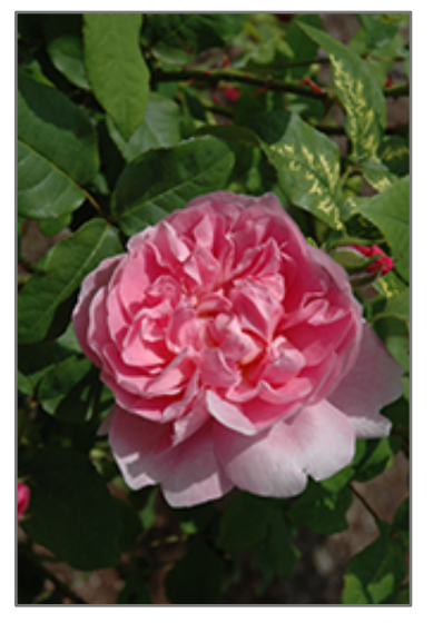
Cottage Rose flowers

93 East Main Street Hopkinton MA 02148 - (508) 435-3414 160 Pine Hill Road Chelmsford MA 01824 - (978) 349-0055 COMMERCIAL: commsales@westonnurseries.com - (508) 293-8028