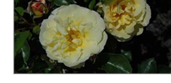
Popcorn Drift Rose flowers

Popcorn Drift Rose is blanketed in stunning double creamy white flowers with buttery yellow overtones at the ends of the branches from late spring to early fall, which emerge from distinctive yellow flower buds. The flowers are excellent for cutting. It has dark green deciduous foliage. The glossy oval compound leaves do not develop any appreciable fall color.