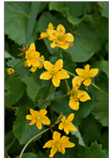
Marsh Marigold flowers