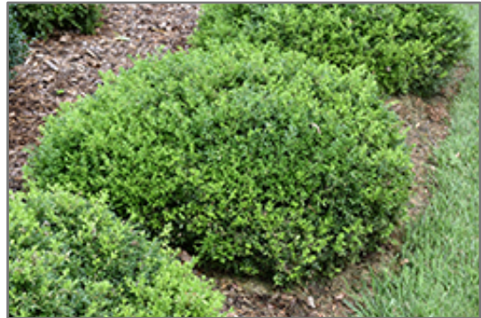
Tide Hill Boxwood