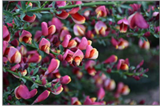
Burkwood's Broom flowers