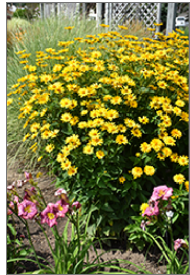
Summer Sun False Sunflower in bloom