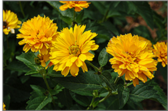
Summer Sun False Sunflower flowers

Summer Sun False Sunflower is recommended for the following landscape applications;