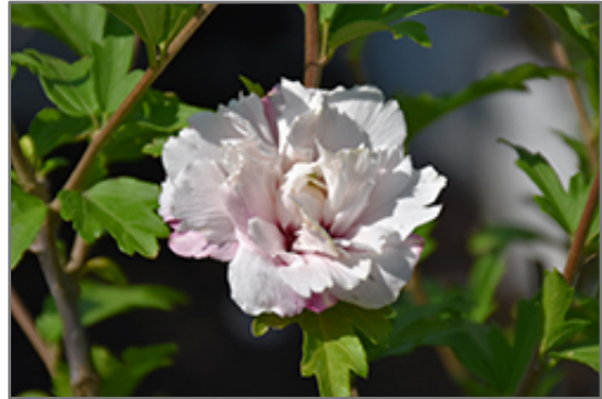
French Cabaret Blush Rose of Sharon flowers

French Cabaret Blush Rose of Sharon is recommended for the following landscape applications;