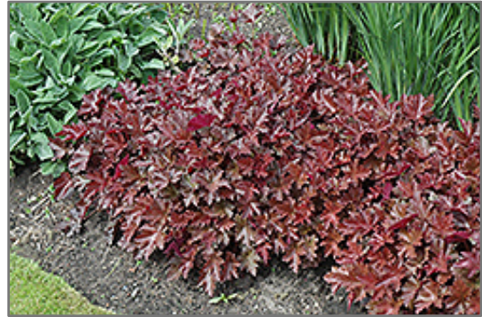
Chocolate Ruffles Coral Bells

This is a relatively low maintenance plant, and should be cut back in late fall in preparation for winter. It is a good choice for attracting hummingbirds to your yard. It has no significant negative characteristics.