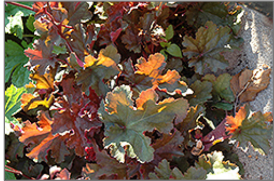
Chocolate Ruffles Coral Bells foliage

Chocolate Ruffles Coral Bells is a fine choice for the garden, but it is also a good selection for planting in outdoor pots and containers. With its upright habit of growth, it is best suited for use as a 'thriller' in the 'spiller-thriller-filler' container combination; plant it near the center of the pot, surrounded by smaller plants and those that spill over the edges. Note that when growing plants in outdoor containers and baskets, they may require more frequent waterings than they would in the yard or garden.