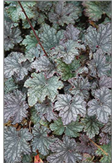
Frosted Violet Coral Bells foliage

This is a relatively low maintenance plant, and should be cut back in late fall in preparation for winter. It is a good choice for attracting hummingbirds to your yard. It has no significant negative characteristics.