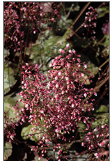
Frosted Violet Coral Bells flowers