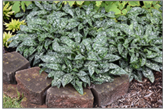
Twinkle Toes Lungwort

Twinkle Toes Lungwort is a fine choice for the garden, but it is also a good selection for planting in outdoor pots and containers. It is often used as a 'filler' in the 'spiller-thriller-filler' container combination, providing a mass of flowers and foliage against which the thriller plants stand out. Note that when growing plants in outdoor containers and baskets, they may require more frequent waterings than they would in the yard or garden.