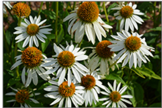
Happy Star Coneflower flowers

Happy Star Coneflower is recommended for the following landscape applications;