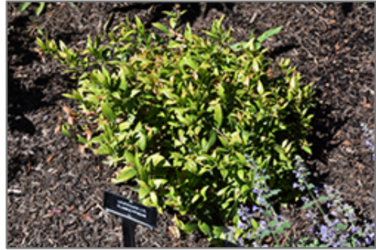
Leafscape Little Flames Fetterbush

Leafscape Little Flames Fetterbush is recommended for the following landscape applications;