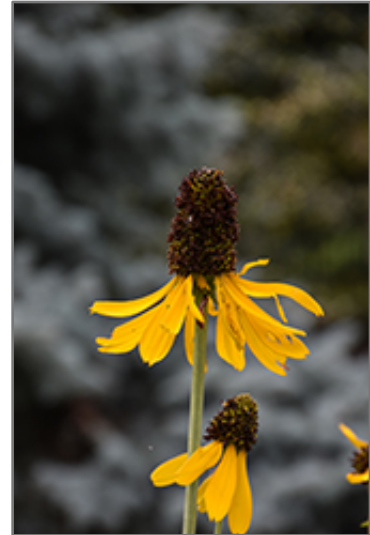
Giant Coneflower flowers

Giant Coneflower is a fine choice for the garden, but it is also a good selection for planting in outdoor pots and containers. With its upright habit of growth, it is best suited for use as a 'thriller' in the 'spiller-thriller-filler' container combination; plant it near the center of the pot, surrounded by smaller plants and those that spill over the edges. It is even sizeable enough that it can be grown alone in a suitable container. Note that when growing plants in outdoor containers and baskets, they may require more frequent waterings than they would in the yard or garden.