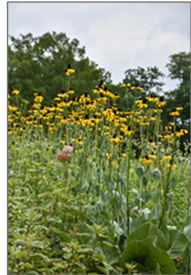
Giant Coneflower in bloom

Giant Coneflower is recommended for the following landscape applications;