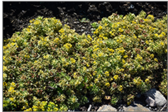
Rock 'N Low Boogie Woogie Stonecrop in bloom