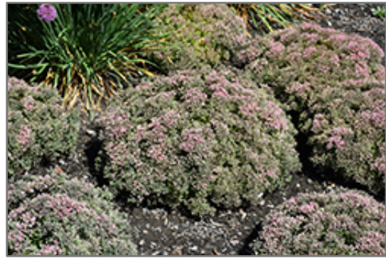
Rock 'N Round Pride and Joy Stonecrop in bloom

Rock 'N Round Pride and Joy Stonecrop is a fine choice for the garden, but it is also a good selection for planting in outdoor pots and containers. It is often used as a 'filler' in the 'spiller-thriller-filler' container combination, providing a mass of flowers and foliage against which the thriller plants stand out. Note that when growing plants in outdoor containers and baskets, they may require more frequent waterings than they would in the yard or garden.