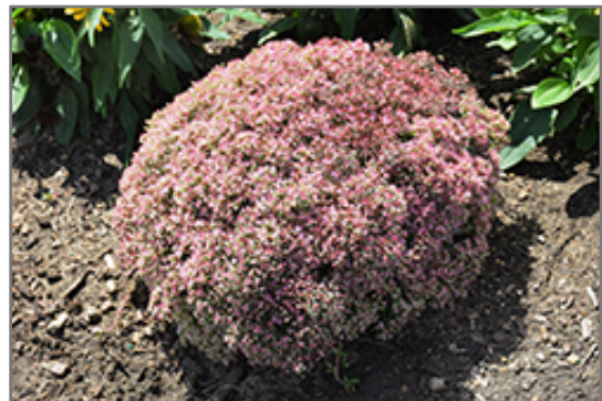
Rock 'N Round Pride and Joy Stonecrop in bloom