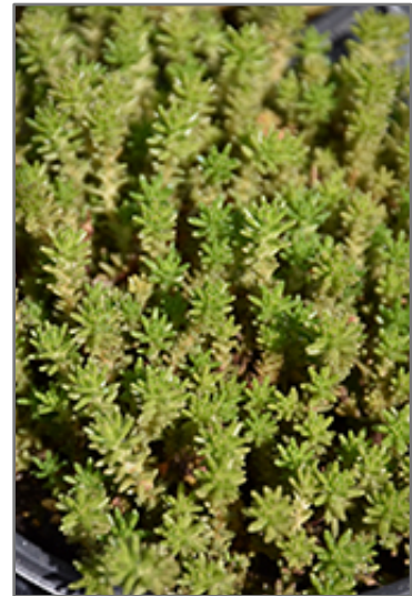
Six Row Stonecrop foliage

Six Row Stonecrop is a fine choice for the garden, but it is also a good selection for planting in outdoor pots and containers. Because of its spreading habit of growth, it is ideally suited for use as a 'spiller' in the 'spiller-thriller-filler' container combination; plant it near the edges where it can spill gracefully over the pot. Note that when growing plants in outdoor containers and baskets, they may require more frequent waterings than they would in the yard or garden.