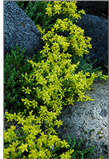
Six Row Stonecrop flowers