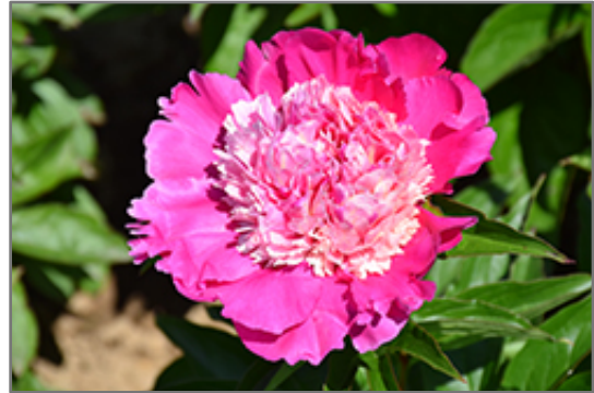
Madame Emile Debatene Peony flowers