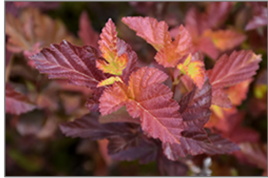
Center Glow Ninebark foliage

Center Glow Ninebark is recommended for the following landscape applications;