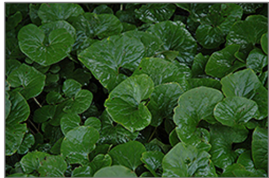
Canadian Wild Ginger