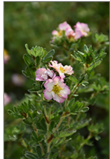
Happy Face Hearts Potentilla flowers