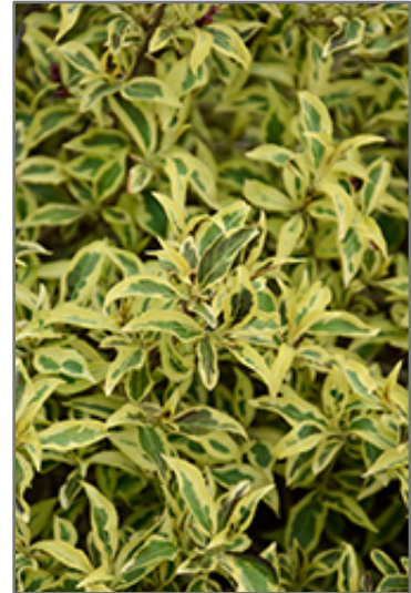
Bubbly Wine Weigela foliage

Bubbly Wine Weigela is recommended for the following landscape applications;