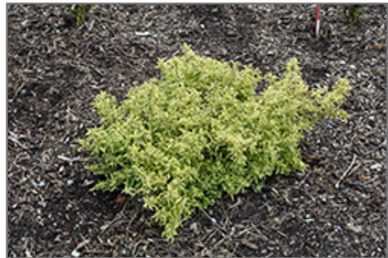
Bubbly Wine Weigela