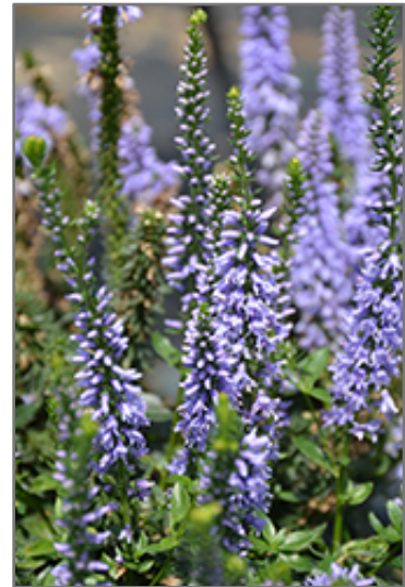
Magic Show Ever After Speedwell flowers

Magic Show Ever After Speedwell is recommended for the following landscape applications;