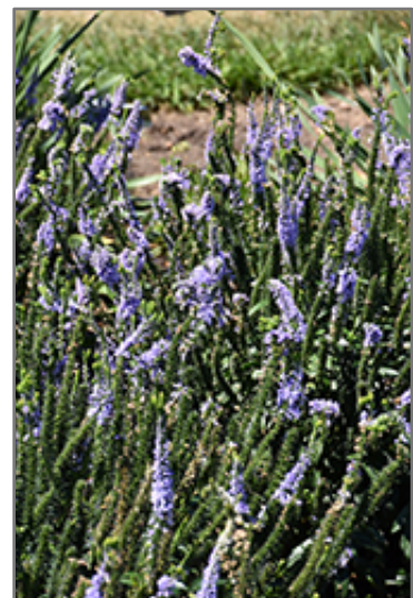
Magic Show Ever After Speedwell flowers