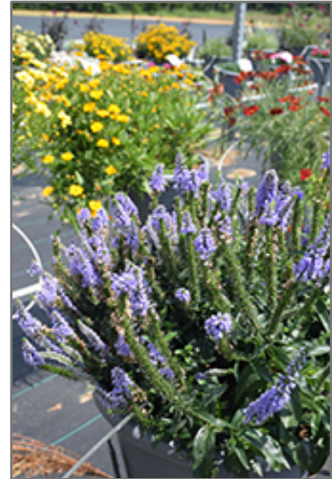
Magic Show Ever After Speedwell in bloom

Magic Show Ever After Speedwell is a fine choice for the garden, but it is also a good selection for planting in outdoor pots and containers. It is often used as a 'filler' in the 'spiller-thriller-filler' container combination, providing a mass of flowers against which the larger thriller plants stand out. Note that when growing plants in outdoor containers and baskets, they may require more frequent waterings than they would in the yard or garden.