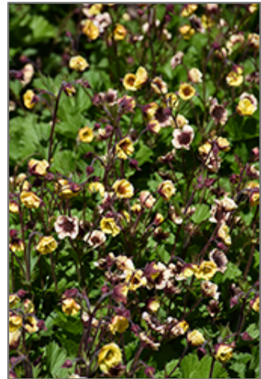
Tempo Yellow Avens flowers

Tempo Yellow Avens is recommended for the following landscape applications;