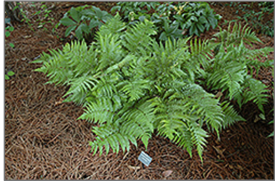
Autumn Fern

Autumn Fern will grow to be about 18 inches tall at maturity, with a spread of 18 inches. Its foliage tends to remain dense right to the ground, not requiring facer plants in front. It grows at a medium rate, and under ideal conditions can be expected to live for approximately 15 years. As an evergreen perennial, this plant will typically keep its form and foliage year-round.