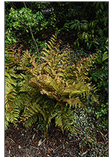
Autumn Fern