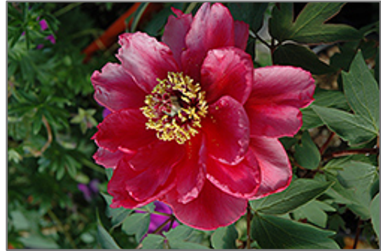
Shimanishiki Tree Peony flowers

A beautiful woody peony for the garden collector, with bold flowers in a rich reddish-purple with prominent streaks of white in spring, great as an accent in the garden; unlike perennial peonies, remember not to prune this variety