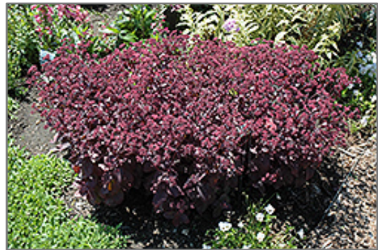
Xenox Stonecrop in bloom