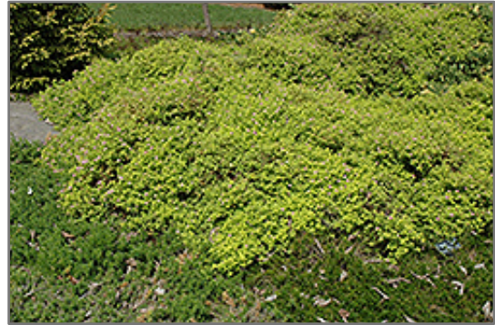
Golden Elf Spirea

Golden Elf Spirea is recommended for the following landscape applications;