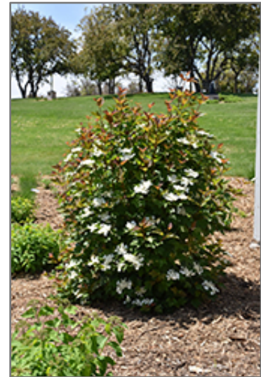
Redwing Highbush Cranberry in bloom