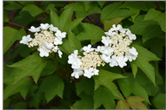
Redwing Highbush Cranberry flowers

Redwing Highbush Cranberry is a dense multi-stemmed deciduous shrub with an upright spreading habit of growth. Its average texture blends into the landscape, but can be balanced by one or two finer or coarser trees or shrubs for an effective composition.