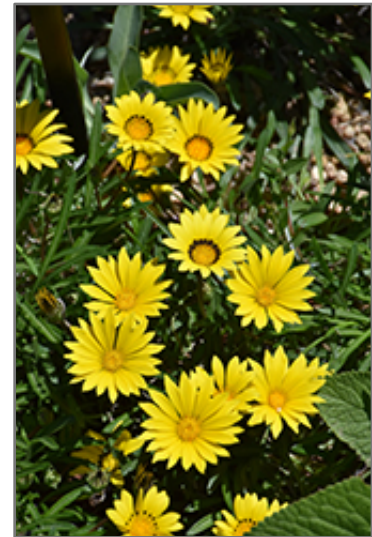
Colorado Gold Gazania flowers

Colorado Gold Gazania is recommended for the following landscape applications;