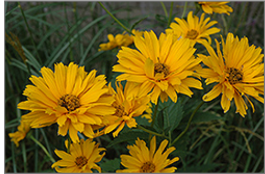
Ballerina False Sunflower flowers