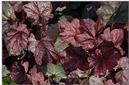
Beaujolais Hairy Alumroot foliage